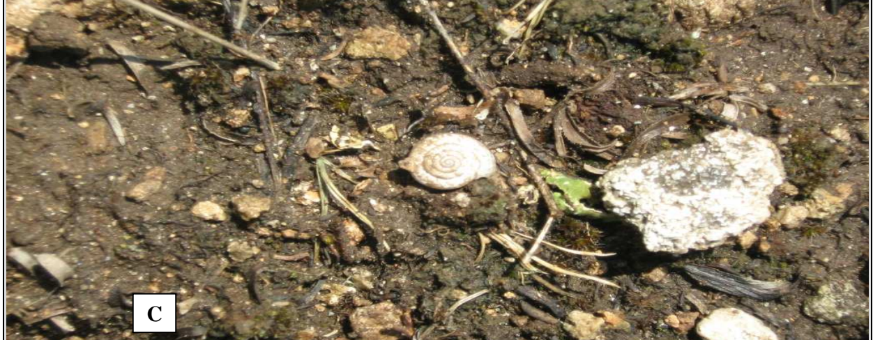
Figure 3: A - Limestone wall with Zebrina varnensis; B - Herbaceous plants with Zebrina detrita; C – picture of Helicella obvia dobrudschae from the large canyon (original photos, 2009)

International Journal of Global Science Research Vol.3, Issue 5, April 2016, pp. 277-288 Available Online at <u>www.ijgsr.com</u> © Copyright 2014 | ijgsr.com | All Rights Reserved