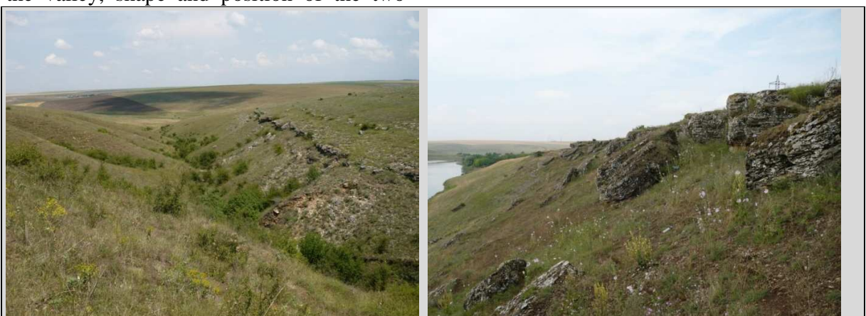
Figure 2: A - Top view of some arms of the large canyon; B - Grassy hill with Sarmatian "limestone to day" (original photos., 2009)

canyons in the south-west of the valley (43^{0}5758.97N, 28^{0}1014.88E) (Figure 2A).